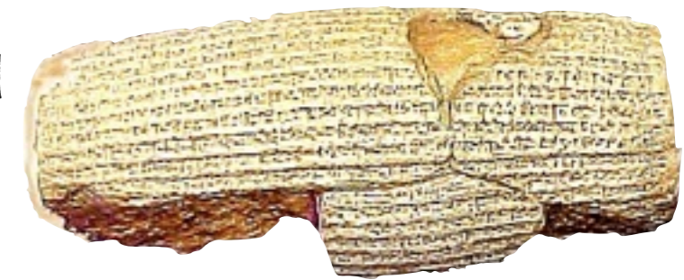
The _____ Cylinder

The Babylonians captured Judah, destroying Jerusalem and the Temple. The Jews were taken off to Babylon and were captives there for 70 years. _____, King of Persia, defeated the Babylonians and he allowed the Jews to return to their homeland and to rebuild their temple, sending aid with them. Bible: Ezra 1