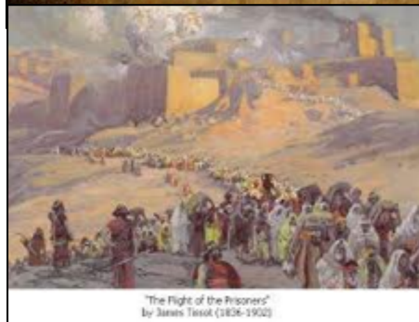
"The Flight of the Prisoners" by James Tissot (1836-1902)