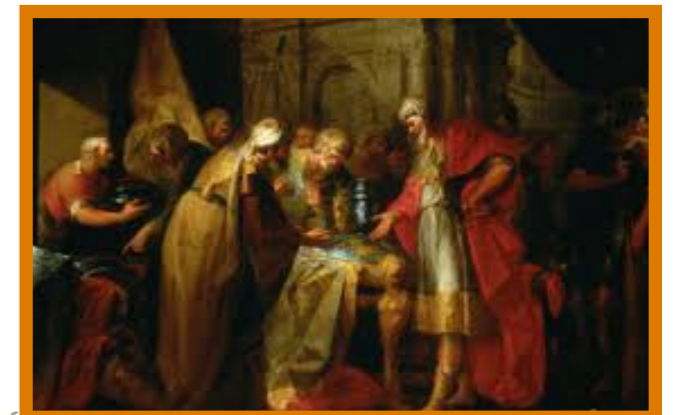
Hezekiah shows all his wealth to visiting Babylonians