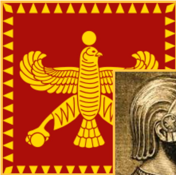
Standard of Cyrus the Great